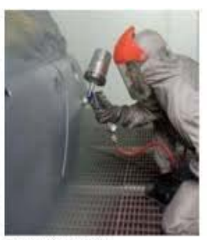
Figure 1 Now you see it